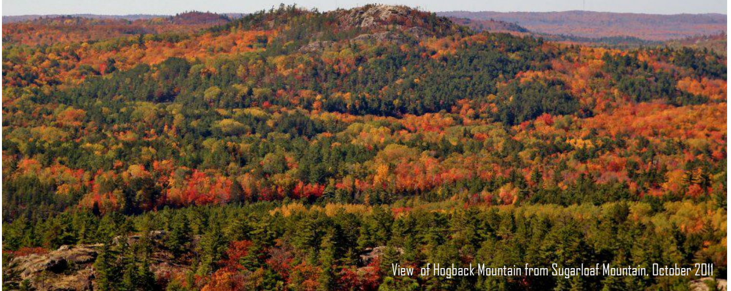
View of Hogback Mountain from Sugarloaf Mountain, October 2011